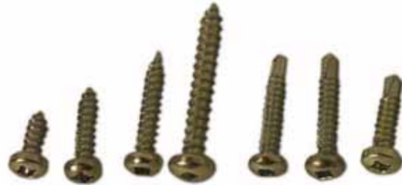
01297, 01298, 01299, 01300, 01301, 01302, 01301